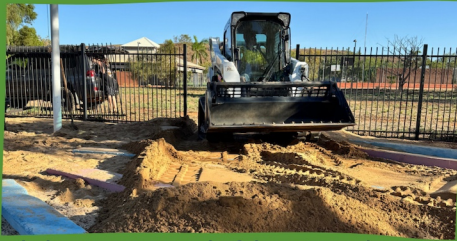
And also to our wonderful centre volunteers