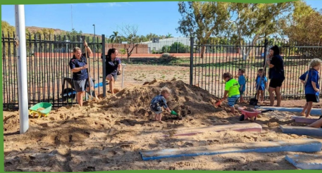
Dibsy's Gardening Services